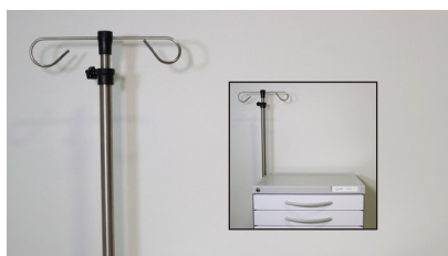
MAYA-IV-POLE IV Pole with Bracket