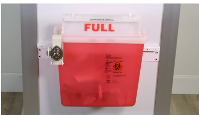
MAYA-SHP 5 Qt. Sharps Container (5 Qt. Locking Bracket Required)