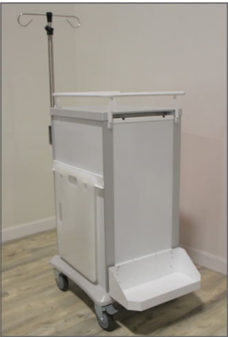
MAYA-CODE-ACCYPACK Optional MayaCode Accessories Package