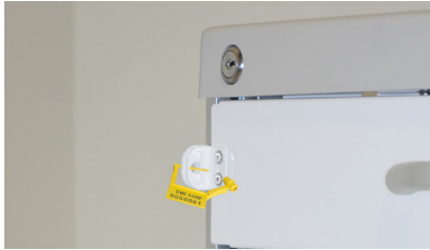
MAYA-BL Single Drawer Breakaway Lock Bracket