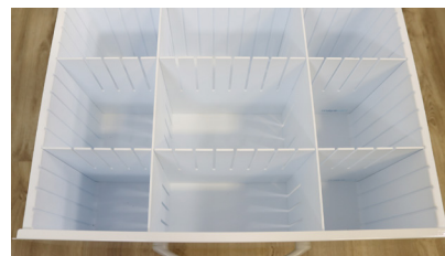
MAYA-9TDSET 9" Tray and Dividers