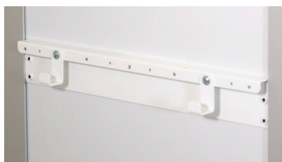
MAYA-UH Utility Hooks **