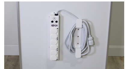
MAYA-CW Cord Wrap