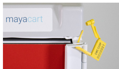
MAYA-BL21, MAYA-BL24, MAYA-BL27 and MAYA-BL30 Breakaway Lock Bar

*requires two side rail mounts (MAYA-SR)