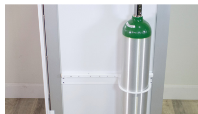
MAYA-O2 Oxygen Tank Holder Kit (O 2 Tank Not Included) *