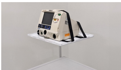
MAYA-DEFIB Defibrillator Shelf (Defibrillator Sold Separately)

*requires two side rail mounts (MAYA-SR)