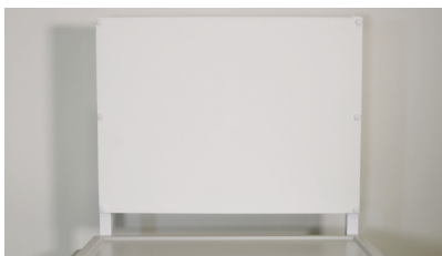
MAYA-BA Backboard with Rear Accessory Rails