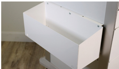
MAYA-BIN Side Storage Bin Medium *