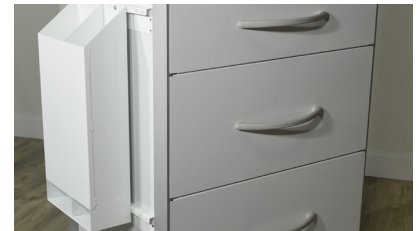
MAYA-CATH Catheter Holder **