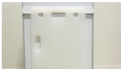
MAYA-CB Cardiac Board