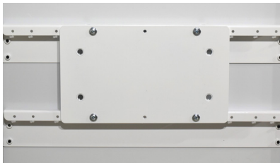
MAYA-SSBRK SSCOR Suction Unit Mounting Bracket**