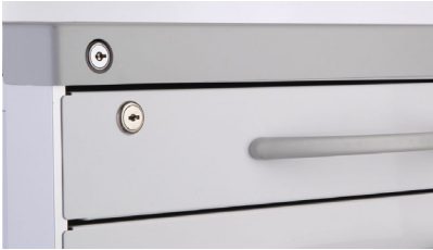
MAYA-CSLOCK Controlled Substance Key Lock for MayaCart Top Drawer ***