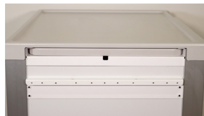
MAYA-SR Side Rail Mount