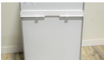
MAYA-CBB Cardiac Board Bracket