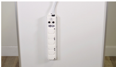
MAYA-PS Medical Grade Power Strip, 6 Outlets, 15 ft. Cord (Cord Wrap Recommended)