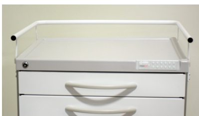
MAYA-GR 3-Sided Guard Rail