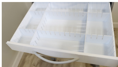
MAYA-3TDSET 3" Tray and Dividers

A full line of accessories compatible with the MayaCode is available to customize the code cart to your needs.