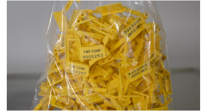
MAYA-BLT Breakaway Lock Seals (Bag of 100)