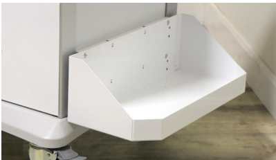
MAYA-SS Suction Shelf *