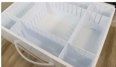
MAYA-6TDSET 6" Tray and Dividers